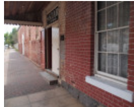
H0278 STAR THEATRE LHA 2015 2.JPG