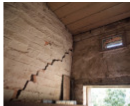
H0278 STAR THEATRE LHA 2015 6.JPG