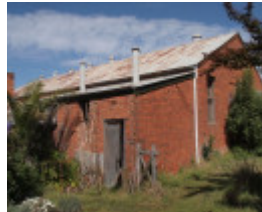
H0278 STAR THEATRE LHA 2015 3.JPG