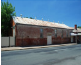
STAR THEATRE SOHE 2008