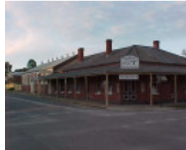
star theatre main street chiltern hotel and theatre