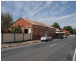
H0278 STAR THEATRE LHA 2015 1.JPG