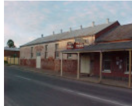
1 star theatre main street chiltern