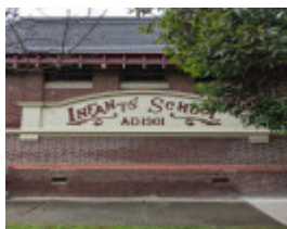
Infant school sign