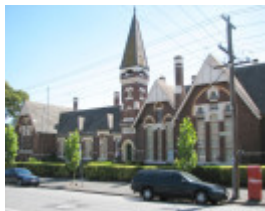
PRIMARY SCHOOL NO.2634 SOHE 2008