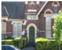
PRIMARY SCHOOL NO.2634 SOHE 2008