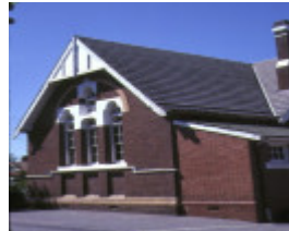
primary school number 2634 densham road armadale detail of front facade