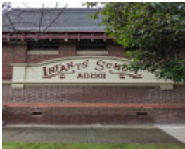
Infant school sign