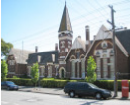
PRIMARY SCHOOL NO.2634 SOHE 2008