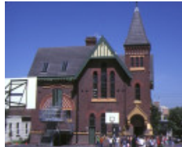
primary school number 2634 densham road armadale infant school front