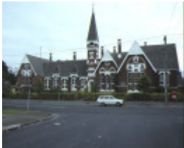
1 primary school number 2634 densham road armadale front elevation