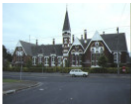
1 primary school number 2634 densham road armadale front elevation