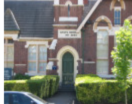
PRIMARY SCHOOL NO.2634 SOHE 2008