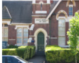
PRIMARY SCHOOL NO.2634 SOHE 2008