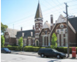
PRIMARY SCHOOL NO.2634 SOHE 2008