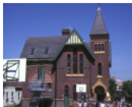
primary school number 2634 densham road armadale infant school front