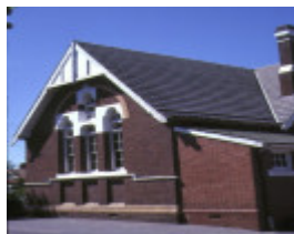
primary school number 2634 densham road armadale detail of front facade