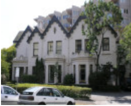
FORMER BENDIGONIA SOHE 2008