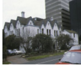
1 former bendigonia queens road south melbourne front corner view