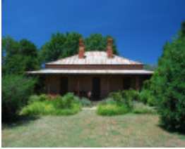
LAKE VIEW SOHE 2008