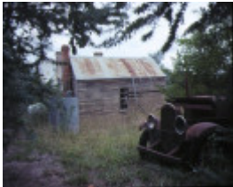
lakeview victoria street chiltern outbuildings may1981