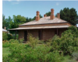
1 lakeview victoria street chiltern front elevation jan00