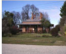
lakeview victoria street chiltern front elevation jul1994