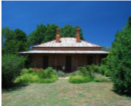
LAKE VIEW SOHE 2008