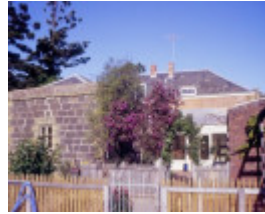
barwon bank riversdale road marnock vale newtown west elevations she project 2004