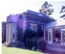
barwon bank riversdale road marnock vale newtown south east cnr she project 2004