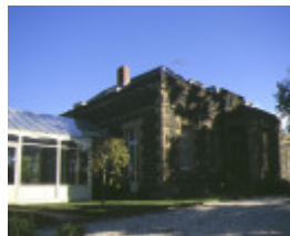
Barwon Bank Riversdale Rd Marnock Vale Newtown Additions 1997