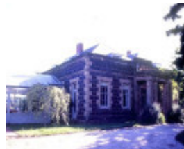
barwon bank riversdale road marnock vale newtown north east cnr she project 2004