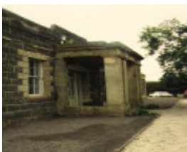
Barwon Bank Riversdale Rd Marnock Vale Newtown Front Entrance Sep 1977