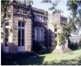
h00425 1 barwon bank riversdale road marnock vale newtown south west cnr she project 2004