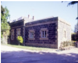
barwon bank riversdale road marnock vale newtown kitchen wing she project 2004