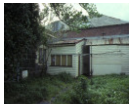
Barwon Bank Riversdale Rd Marnock Vale Newtown Kitchen Wing Sep 1977