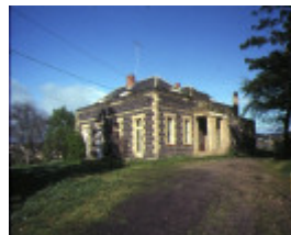
Barwon Park Riversdale Rd Marnock Vale Newtown Front View Sep 1977