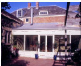
barwon bank riversdale road marnock vale newtown sunroom she project 2004