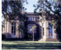
barwon bank riversdale road marnock vale newtown bay windows she project 2004