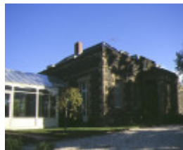
Barwon Bank Riversdale Rd Marnock Vale Newtown Additions 1997