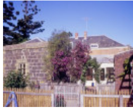
barwon bank riversdale road marnock vale newtown west elevations she project 2004