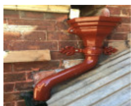
After Photograph - Reference F3838 2016