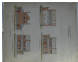
Essendon Court House Plan 1.jpg