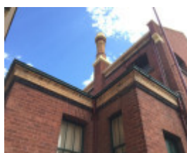
After Photograph - Reference F3838 2016