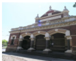
FORMER MOONEE PONDS COURT HOUSE SOHE 2008