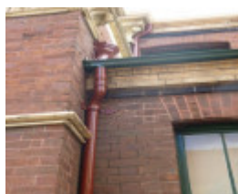
After Photograph - Reference F3838 2016