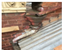
Before Photograph - Reference F3838 2014