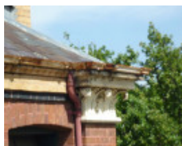
Before Photograph - Reference F3838 2014