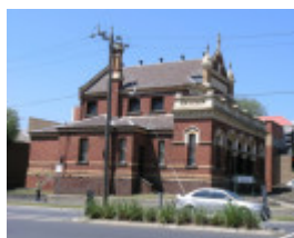
FORMER MOONEE PONDS COURT HOUSE SOHE 2008