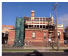
During Photograph - Reference F3838 2015