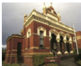
1 former moonee ponds court house mount alexander road moonee ponds front view 1994