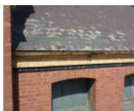
Before Photograph - Reference F3838 2014