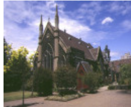
1 former independent church malvern road armadale west elevation feb1994