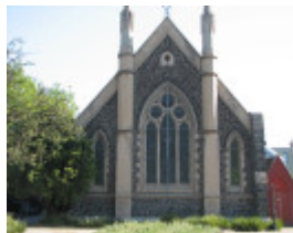
FORMER INDEPENDENT CHURCH SOHE 2008