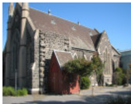
FORMER INDEPENDENT CHURCH SOHE 2008