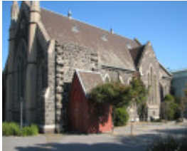
FORMER INDEPENDENT CHURCH SOHE 2008