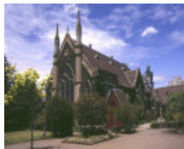
1 former independent church malvern road armadale west elevation feb1994