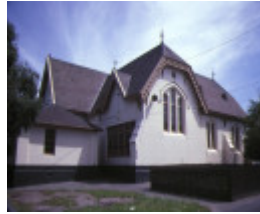
1 primary school number 1252 lee street carlton north side elevation feb1985