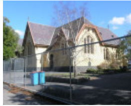
PRIMARY SCHOOL NO. 1252 SOHE 2008