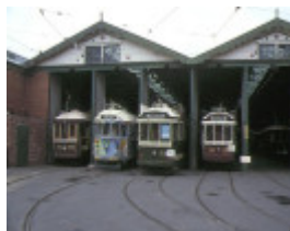
1 bendigo tram sheds front view of tram sheds