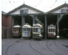
1 bendigo tram sheds front view of tram sheds