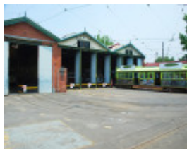
BENDIGO TRAM SHEDS, OFFICES AND POWER STATION SOHE 2008