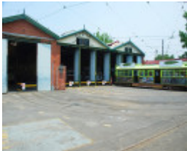
BENDIGO TRAM SHEDS, OFFICES AND POWER STATION SOHE 2008