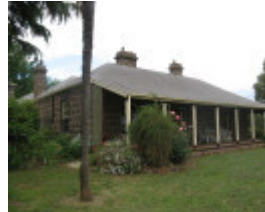
Correagh house from east