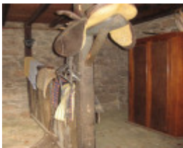
Correagh stable interior