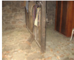
Correagh interior of stable