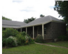
Correagh former kitchen wing