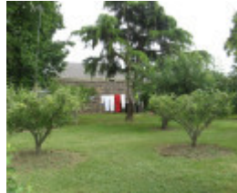
Correagh house from orchard (east)