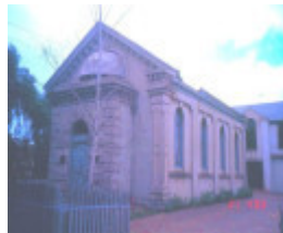
Former Synagogue McKillip St Geelong Exterior View West SHE Project 2003