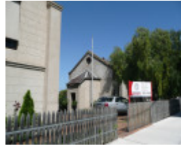
FORMER SYNAGOGUE SOHE 2008