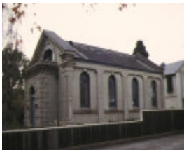
h01103 former synagogue yarra street geelong side view