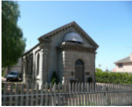
FORMER SYNAGOGUE SOHE 2008