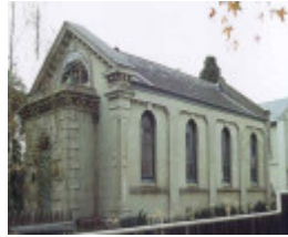
h01103 1 former synagogue yarra street geelong fromt corner elevation publication