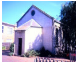
Former Synagogue McKillip St Geelong Exterior North East Corner SHE Project 2003