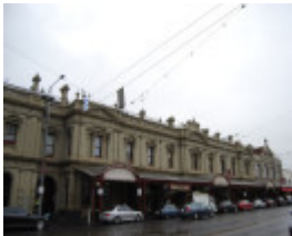
3016 Hotham Town Hall Municipal Buildings View 02