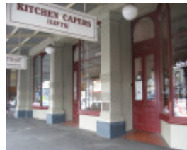
Municipal Buildings_North Melbourne_shops_KJ_Nov 09