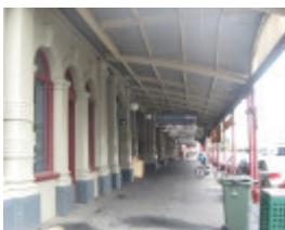
Municipal Buildings_North Melbourne_shops_KJ_Nov 09