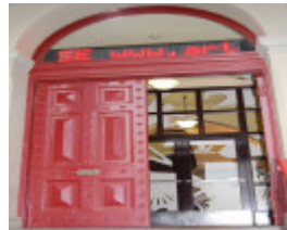
3016 Hotham Town Hall Queensberry St Door 02