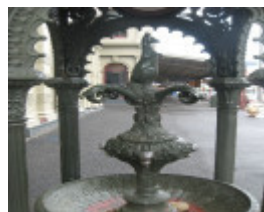
North Melbourne Town Hall_Henderson Fountain detail_KJ_29 nov 09 (36).jpg