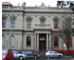
3016 Hotham Town Hall Queensberry St Entrance 02