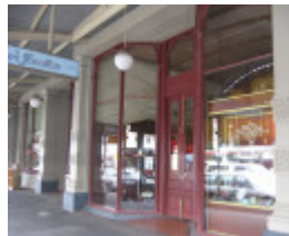
Municipal Buildings_North Melbourne_shops_KJ_Nov 09