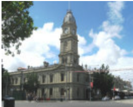
North Melbourne Town Hall_KJ_Nov 09