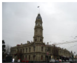
3016 Hotham Town Hall Cnr Queensberry and Errol Sts 02