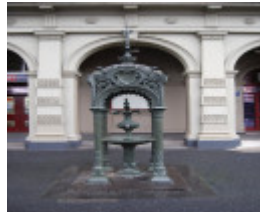
3016 Hotham Town Hall Errol St Fountain 02