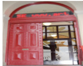
3016 Hotham Town Hall Queensberry St Door 02