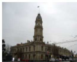
3016 Hotham Town Hall Cnr Queensberry and Errol Sts 02