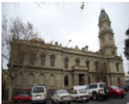
3016 Hotham Town Hall Queensberry St View 02