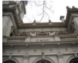
3016 Hotham Town Hall Errol St Detail 02