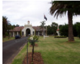
Former Wireless Beam Station