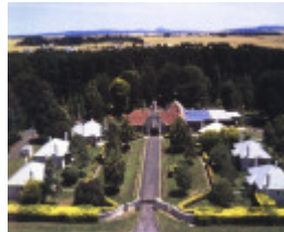
Rockbank Beam Wireless Station