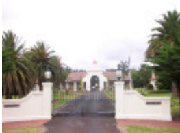
Former Wireless Beam Station