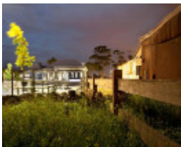
Morton Homestead 2011