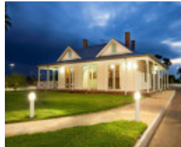
Homestead - 2011