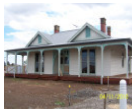
Homestead - November 2010