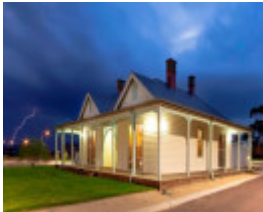
Morton Homestead 2011