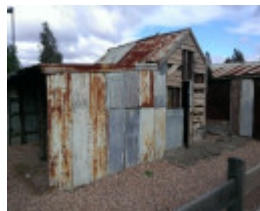
Dairy Buildings - May 2013