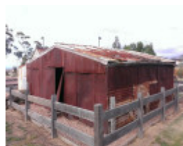
Dairy Buildings - May 2013