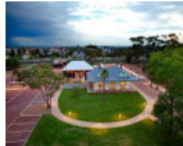
Morton Homestead 2011