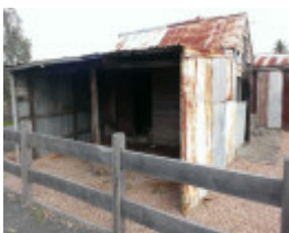
Dairy Buildings - May 2013