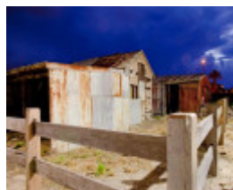
Dairy Buildings - 2011