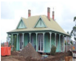
Homestead - April 2010