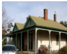
Homestead - 2005