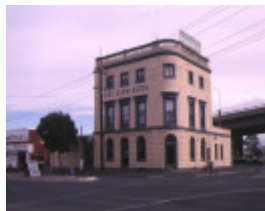
1 bay view hotel mercer street geelong front corner view aug1995