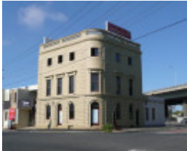
BAY VIEW HOTEL SOHE 2008