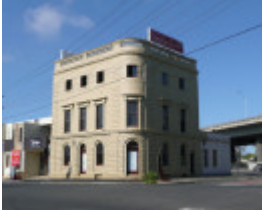
BAY VIEW HOTEL SOHE 2008