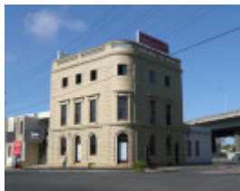
BAY VIEW HOTEL SOHE 2008