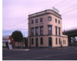
1 bay view hotel mercer street geelong front corner view aug1995