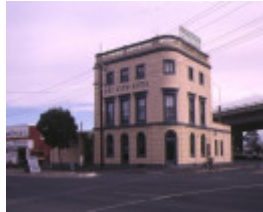
1 bay view hotel mercer street geelong front corner view aug1995