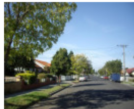
HO12(4) - War Service Homes, Heritage Area, Maribyrnong.JPG