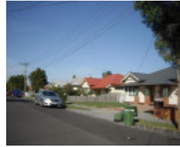
HO12(3) - War Service Homes, Heritage Area, Maribyrnong.JPG