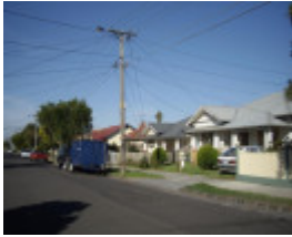
HO12(5) - War Service Homes, Heritage Area, Maribyrnong.JPG