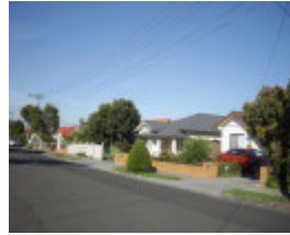
HO12(2) - War Service Homes, Heritage Area, Maribyrnong.JPG