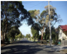
HO12(1) - War Service Homes, Heritage Area, Maribyrnong.JPG