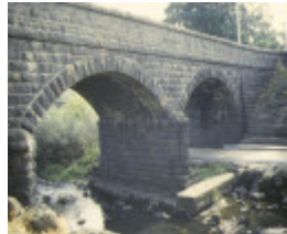
bridge newlands road coburg side detail