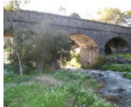
H1446 Newlands Road Bridge 3 Sep 2008