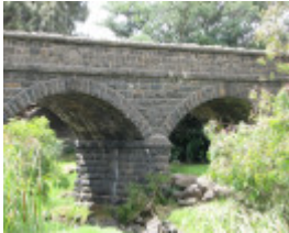
BRIDGE SOHE 2008