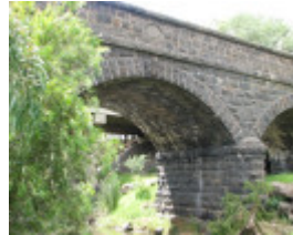
BRIDGE SOHE 2008