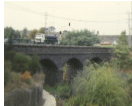
bridge newlands road coburg side view