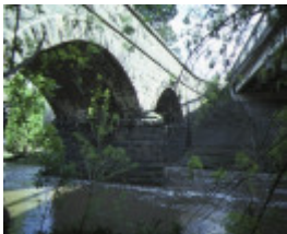
bridge newlands road coburg side elevation sep1984