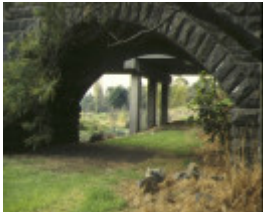
bridge newlands road coburg detail of arch may1997