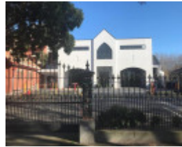
3B Epping Street, Malvern East