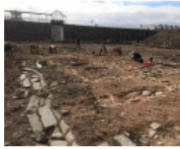
Pentridge excavation by Dig Intl