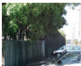
H01551 pentridge urquhart st wall mar02