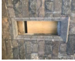
Repairs to B1