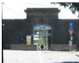
HM PRISON PENTRIDGE SOHE 2008