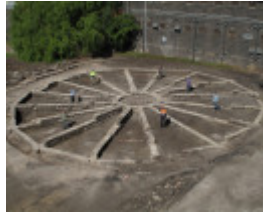
Pentridge excavation by Dig Intl