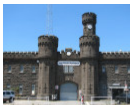
HM PRISON PENTRIDGE SOHE 2008