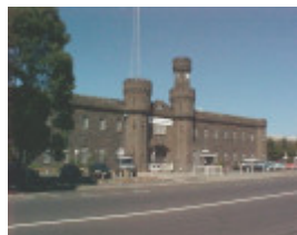
H01551 1 pentridge mar02