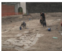
Pentridge excavation by Dig Intl