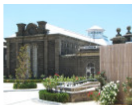
HM PRISON PENTRIDGE SOHE 2008