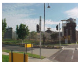
H01551 pentridge h division may 02