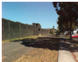
H01551 pentridge champ st frontage1 mar02