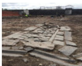
Pentridge excavation by Dig Intl