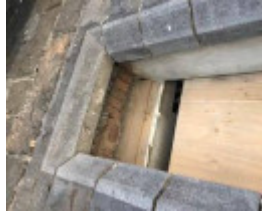
Repairs to B1