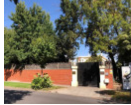
75-77 Irving Road, Toorak