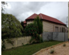
House 23 Bridge Street