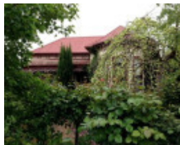
House 23 Bridge Street