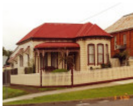
Dwelling at 23 Bridge Street Korumburra 3950