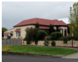
House 23 Bridge Street