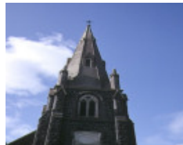
holy trinity anglican church complex sydney road coburg spire detail aug1992