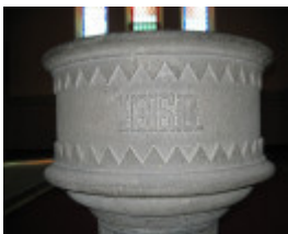
H0959 Holy Trinity Coburg 9 Nov 2009 024.jpg