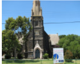
HOLY TRINITY ANGLICAN CHURCH COMPLEX SOHE 2008