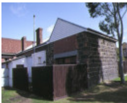
holy trinity anglican church complex sydney road coburg school rear view aug1992