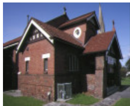
holy trinity anglican church complex sydney road coburg view of chruch hall aug1992