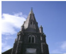
holy trinity anglican church complex sydney road coburg spire detail aug1992