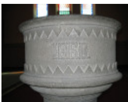
H0959 Holy Trinity Coburg 9 Nov 2009 024.jpg