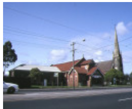
holy trinity anglican church complex sydney road coburg property view of church aug1992