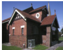
holy trinity anglican church complex sydney road coburg view of church hall aug1992