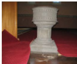
H0959 Holy Trinity Coburg 9 Nov 2009 023.jpg