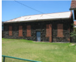
HOLY TRINITY ANGLICAN CHURCH COMPLEX SOHE 2008