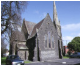
1 holy trinity anglican church complex sydney road coburg side view of church aug1992