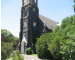
HOLY TRINITY ANGLICAN CHURCH COMPLEX SOHE 2008