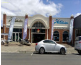
Knight's Garage (former, 2020)