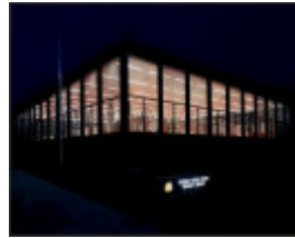
View of the Toorak/South Yarra Library at night, shortly after completion and opening (c. 1973).