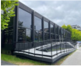
Toorak/South Yarra Library (c. November 2024).