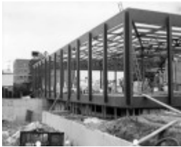
Rear of Toorak/South Yarra Library under construction (c. 1973).