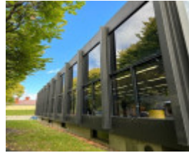
Side elevation of the Toorak/South Yarra Library, adjacent to Cromwell Road (c. November 2024).