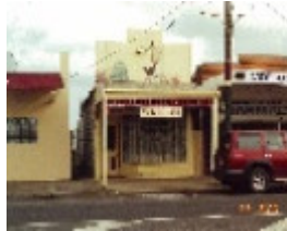
Shop, 86 Ridgway (2000)