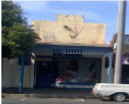
Shop - 86 Ridgway (2020)