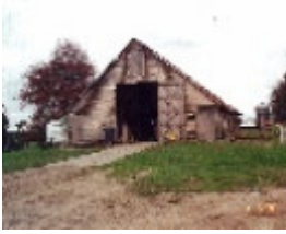
Dorfstedt barn (2000)