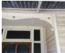
Dorfstedt entry detail (2015)