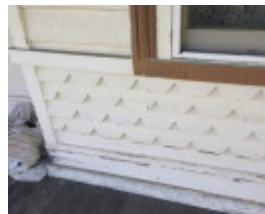
Dorfstedt bay window notched detail (2015)