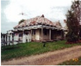
Dorfstedt homestead (2000)