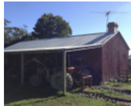
Dorfstedt stables and workers cabin (2015)