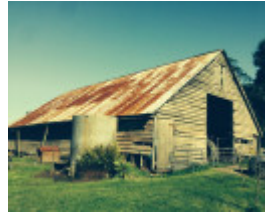
Dorfstedt Barn (2015)