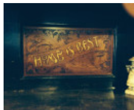
Dorfstedt interior - living room fireplace motto 2 (2015)