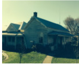
Dorfstedt kitchen wing (2015)