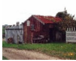
Dorfstedt outbuilding (2000)