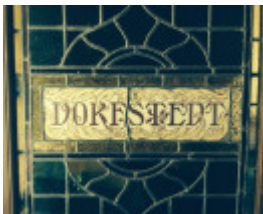
Dorfstedt front door leadlight name (2015)