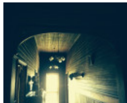
Dorfstedt interior - hallway (2015)