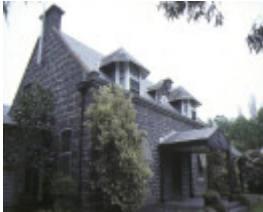
1 manor house eldon street broadmeadows front view