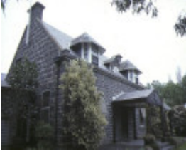
1 manor house eldon street broadmeadows front view