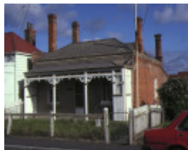
1 st elmo elizabeth street geelong front view apr1995