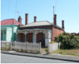
ST ELMO SOHE 2008