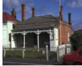
1 st elmo elizabeth street geelong front view apr1995