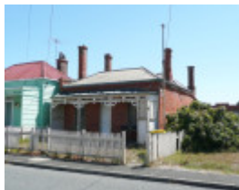
ST ELMO SOHE 2008