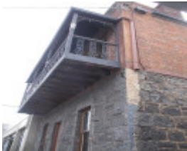
H0871 BELMONT LHA 2015 2.JPG