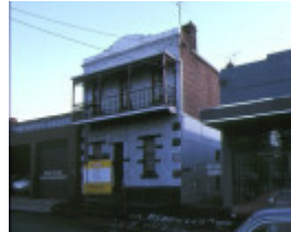
1 Belmont Johnston Street Collingwood front view