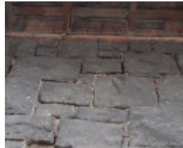
H0871 BELMONT LHA 2015 4.JPG