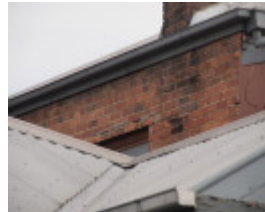
H0871 BELMONT LHA 2015 3.JPG