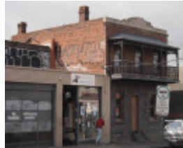
H0871 BELMONT LHA 2015 1.JPG