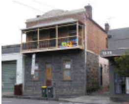
BELMONT SOHE 2008