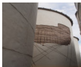
H1011 FORMER WIMMERA FLOUR MILL AND SILO COMPLEX LHA 2015 9.JPG