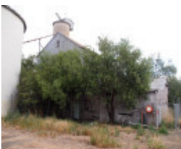
H1011 FORMER WIMMERA FLOUR MILL AND SILO COMPLEX LHA 2015 4.JPG