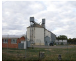
FORMER WIMMERA FLOUR MILL AND SILO COMPLEX SOHE 2008