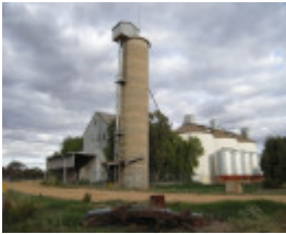
FORMER WIMMERA FLOUR MILL AND SILO COMPLEX SOHE 2008