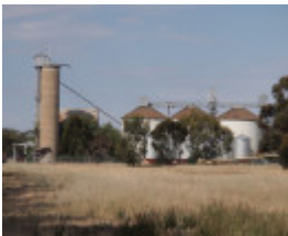
H1011 FORMER WIMMERA FLOUR MILL AND SILO COMPLEX LHA 2015 1.JPG