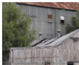
H1011 FORMER WIMMERA FLOUR MILL AND SILO COMPLEX LHA 2015 6.JPG