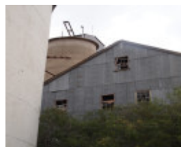
H1011 FORMER WIMMERA FLOUR MILL AND SILO COMPLEX LHA 2015 5.JPG