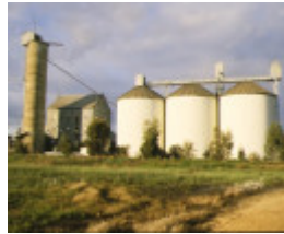
1 former wimmera flour mill & silo complex gibson street rpanyup silos side view