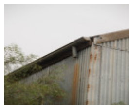
H1011 FORMER WIMMERA FLOUR MILL AND SILO COMPLEX LHA 2015 8.JPG