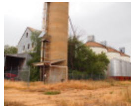
H1011 FORMER WIMMERA FLOUR MILL AND SILO COMPLEX LHA 2015 2.JPG