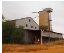
H1011 FORMER WIMMERA FLOUR MILL AND SILO COMPLEX LHA 2015 3.JPG