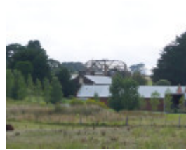
FORMER BRIND'S DISTILLERY SOHE 2008