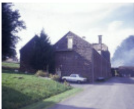
former brinds distillery old melbourne road dunnstown main building west side she project 2003