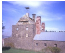
former brinds distillery old melbourne road dunnstown main building roof she project 2003