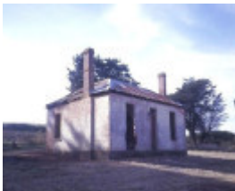
former brinds distillery old melbourne road dunnstown bond store managers residence she project 2003