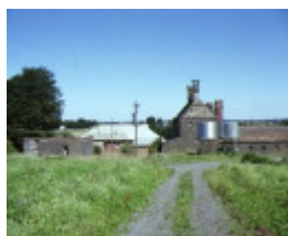
1 former distillery old melbourne road dunnstown property view