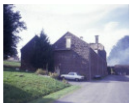
former brinds distillery old melbourne road dunnstown main building west side she project 2003