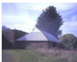
former brinds distillery old melbourne road dunnstown murphys stables she project 2003