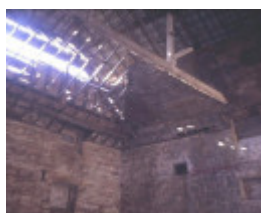
former brinds distillery old melbourne road dunnstown roof main building she project 2003