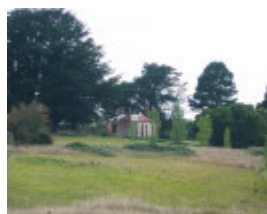
FORMER BRIND'S DISTILLERY SOHE 2008