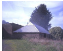
former brinds distillery old melbourne road dunnstown murphys stables she project 2003