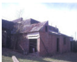
former brinds distillery old melbourne road dunnstown generator shed she project 2003