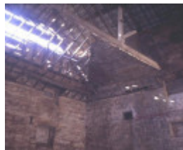
former brinds distillery old melbourne road dunnstown roof main building she project 2003