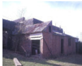
former brinds distillery old melbourne road dunnstown generator shed she project 2003