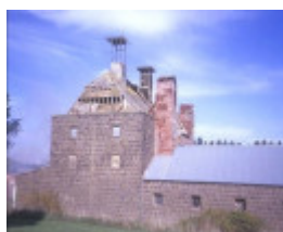
former brinds distillery old melbourne road dunnstown main building roof she project 2003