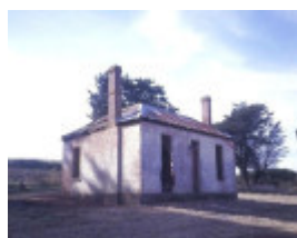
former brinds distillery old melbourne road dunnstown bond store managers residence she project 2003