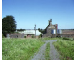
1 former distillery old melbourne road dunnstown property view