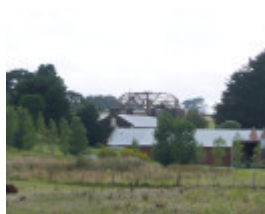
FORMER BRIND'S DISTILLERY SOHE 2008