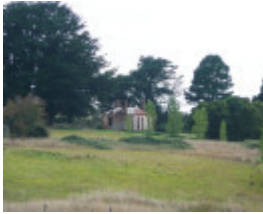
FORMER BRIND'S DISTILLERY SOHE 2008