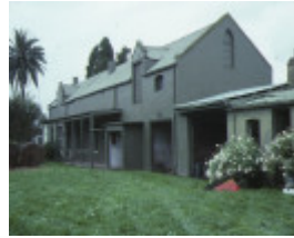
1 yering station melba hwy coldstream front stables