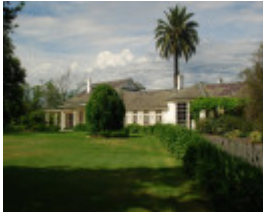
CHATEAU YERING SOHE 2008