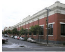
PART OF FORMER FOY AND GIBSON COMPLEX SOHE 2008