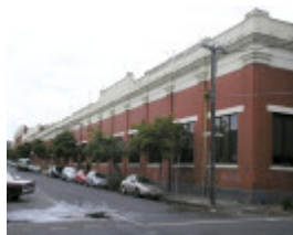
PART OF FORMER FOY AND GIBSON COMPLEX SOHE 2008