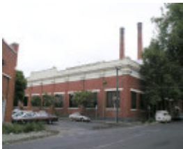
PART OF FORMER FOY AND GIBSON COMPLEX SOHE 2008