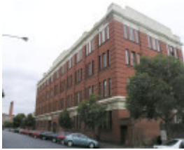
PART OF FORMER FOY AND GIBSON COMPLEX SOHE 2008