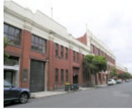
PART OF FORMER FOY AND GIBSON COMPLEX SOHE 2008