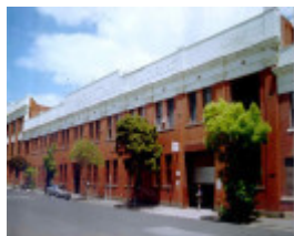
1 part of foy & gibson oxford street collingwood side view dec1997