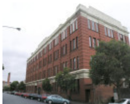
PART OF FORMER FOY AND GIBSON COMPLEX SOHE 2008