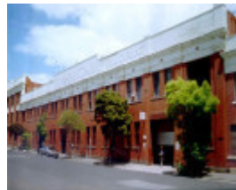
1 part of foy & gibson oxford street collingwood side view dec1997