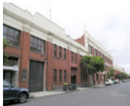
PART OF FORMER FOY AND GIBSON COMPLEX SOHE 2008