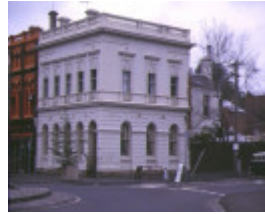
1 former bank of australasia nelson place williamstown front view jun1998