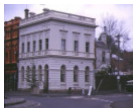
1 former bank of australasia nelson place williamstown front view jun1998