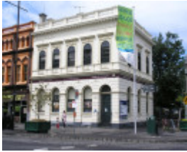
FORMER BANK OF AUSTRALASIA SOHE 2008