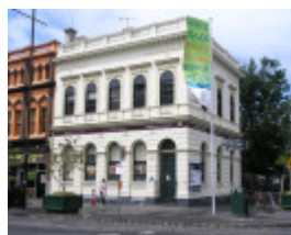
FORMER BANK OF AUSTRALASIA SOHE 2008