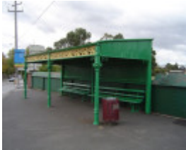
HO365 Tram Shelter