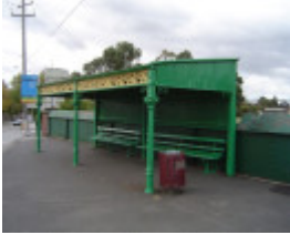
HO365 Tram Shelter