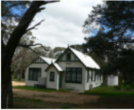
Former State School Illabarook -Berringa Road Berringa