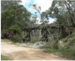
Mt Misery Creek Trestle Bridge, Berringa