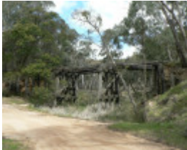
Mt Misery Creek Trestle Bridge, Berringa