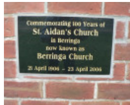
St Aidan's Church Berringa - details