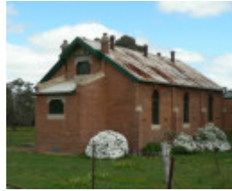
St Aidan's Church Berringa - details