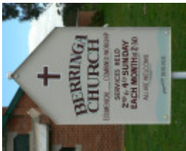
St Aidan's Church Berringa - details