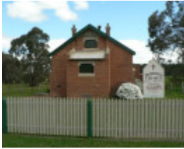
St Aidans Church of England, Berringa