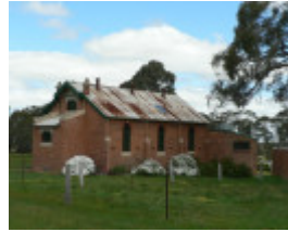
St Aidan's Church Berringa - details