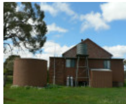
St Aidan's Church Berringa - details