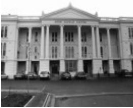
Anne Caudle Centre, formerly Bendigo Benevolent Asylum, Barnard Street