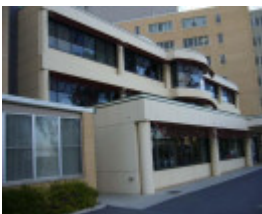
John Lindell Rehabilitation Unit 1999