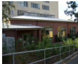
Hydrotherapy Unit 1993