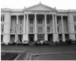
Anne Caudle Centre, formerly Bendigo Benevolent Asylum, Barnard Street