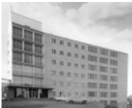
East Wing 1958