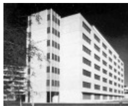
North Wing 1973-74