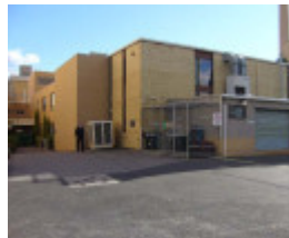
Engineering Building 1967