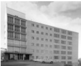
East Wing 1958