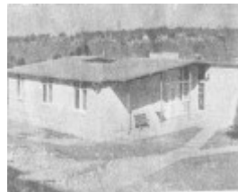
HART former Nurses Quarters 1958