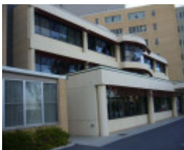
John Lindell Rehabilitation Unit 1999