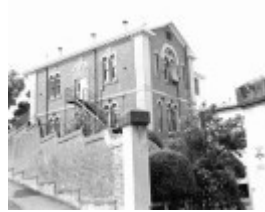
Nurses home, Anne Caudle Centre