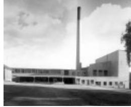
Boiler House and Laundry 1956