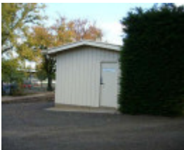
Gardeners Shed post 1950