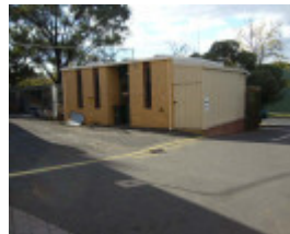
Electrical workshop 1984