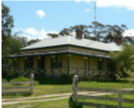
Former Mine Manager's Residence 15 Sykes Rd Berringa