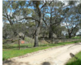
Williams Fancy Co, Mullock Heaps opp 15 Sykes Rd Berringa