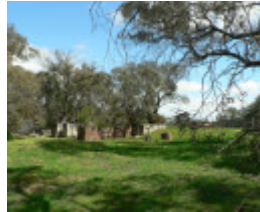
Williams Fancy Co opp 15 Sykes Rd Berringa