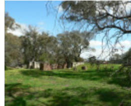
Williams Fancy Co opp 15 Sykes Rd Berringa