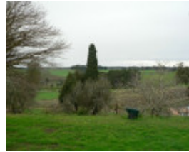
Piggoreet West Homestead front garden looking north east