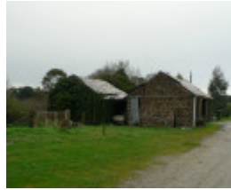
Piggoreet West Homestead Stables & Barn