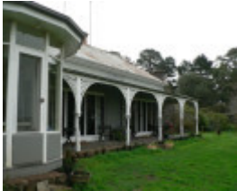
Piggoreet West Homestead viewed from the south east