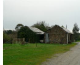
Piggoreet West Homestead Stables & Barn east