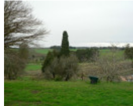
Piggoreet West Homestead front garden looking north east