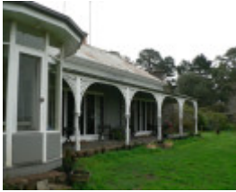
Piggoreet West Homestead viewed from the south east