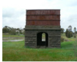
View of Lethbridge Railway Watertank and reservoir