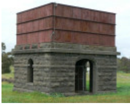
Lethbridge Railway Watertank