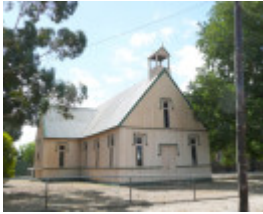
FORMER ST PAULS CHURCH OF ENGLAND SOHE 2008