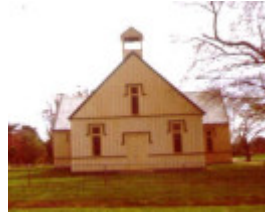
1 st pauls anglican church hall clunes front view ms sept 99