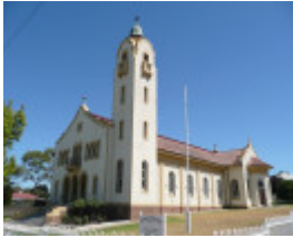
HOLY SPIRIT CHURCH SOHE 2008