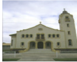
1 holy spirit church bostock avenue manifold heights front view apr1997