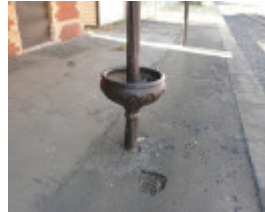
CRESWICK RAILWAY STATION COMPLEX SOHE 2008