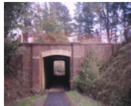
creswick railway complex pedestrian subway may1995