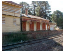
Creswick Railway Complex Signal Box