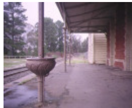
creswick railway complex platform may1995