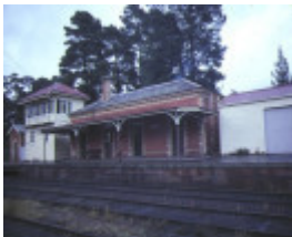
1 creswick railway complex trackside view sep1984