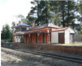
CRESWICK RAILWAY STATION COMPLEX SOHE 2008