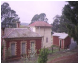
creswick railway complex rear view may1995