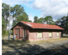
CRESWICK RAILWAY STATION COMPLEX SOHE 2008