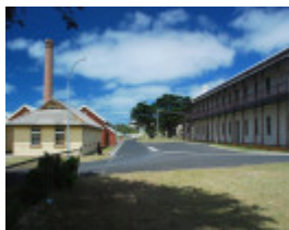
POINT NEPEAN DEFENCE AND QUARANTINE PRECINCT SOHE 2008