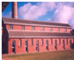
H02030 point nepean bathhouse2