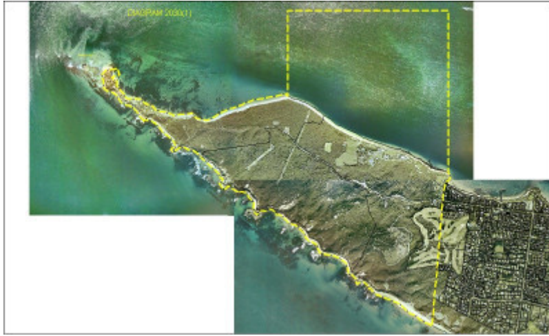
Point Nepean Plan