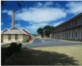
POINT NEPEAN DEFENCE AND QUARANTINE PRECINCT SOHE 2008