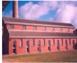
H02030 point nepean bathhouse2