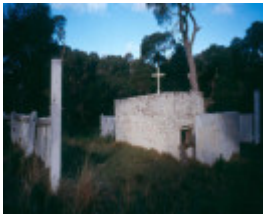
H02030 point nepean crematorium