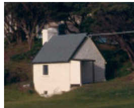
H02030 point nepean shepherds hut