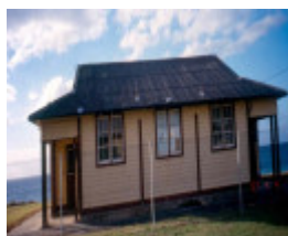
H02030 point nepean showerblock