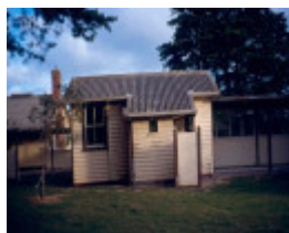
H02030 point nepean isolation hospital