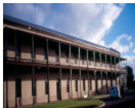
H02030 1point nepean hospital