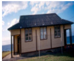
H02030 point nepean showerblock