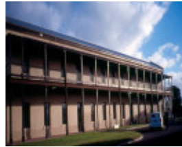
H02030 1point nepean hospital