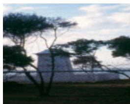
H02030 point nepean heatons monument