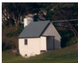
H02030 point nepean shepherds hut