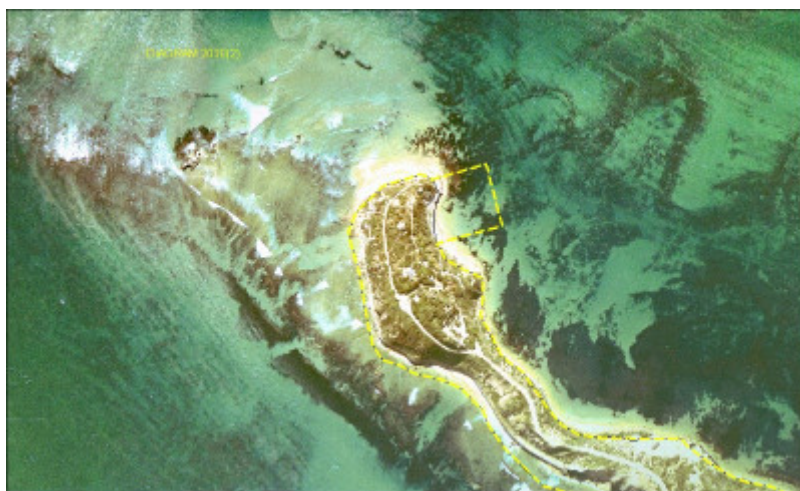
Point Nepean Plan