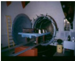
H02030 point nepean quarantine interior