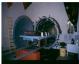
H02030 point nepean quarantine interior