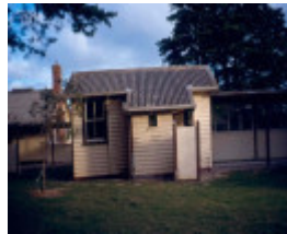
H02030 point nepean isolation hospital