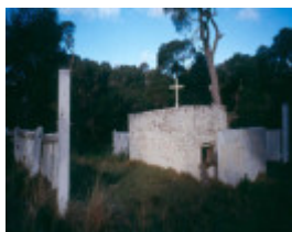
H02030 point nepean crematorium