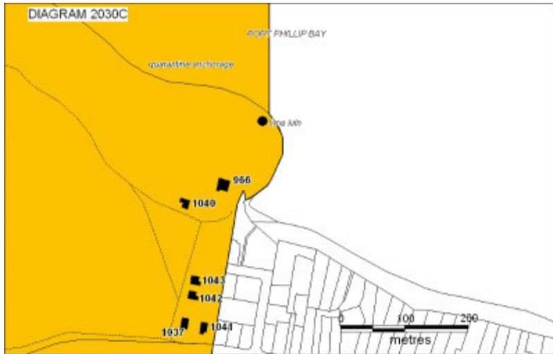
h02030 portseac plan