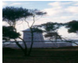
H02030 point nepean heatons monument