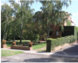
RESIDENCE SOHE 2008