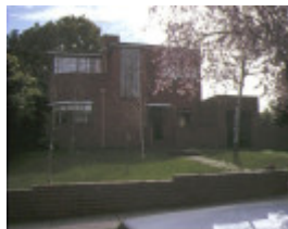
1 residence 2 riverview road essendon front view