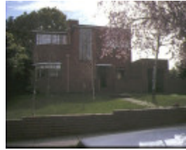
1 residence 2 riverview road essendon front view