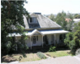
PREFABRICATED RESIDENCE SOHE 2008