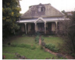
1 prefabricated residence ormond road moonee ponds front view