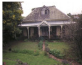
1 prefabricated residence ormond road moonee ponds front view