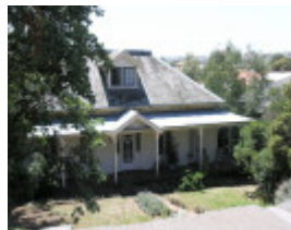
PREFABRICATED RESIDENCE SOHE 2008