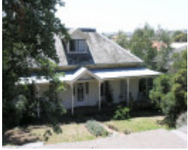
PREFABRICATED RESIDENCE SOHE 2008