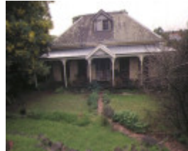
1 prefabricated residence ormond road moonee ponds front view