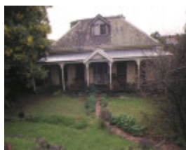
1 prefabricated residence ormond road moonee ponds front view