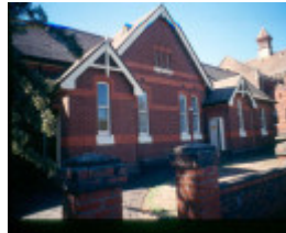
h02034 uniting church auburn sunday school