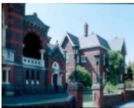
h02034 uniting church auburn manse