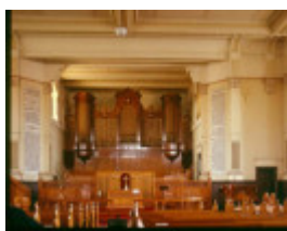
h02034 uniting church auburn interior and organ