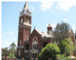
AUBURN UNITING CHURCH COMPLEX SOHE 2008