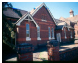
h02034 uniting church auburn sunday school