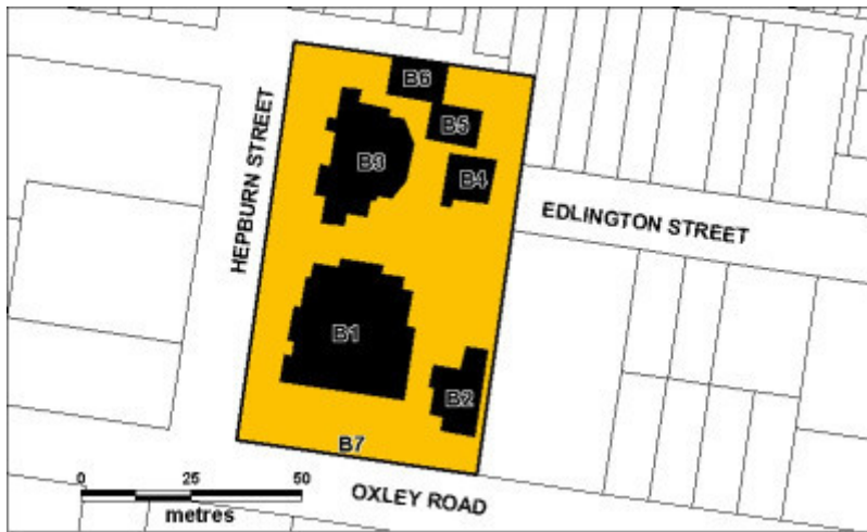
h02034 uniting church auburn h2034 extent april 2003