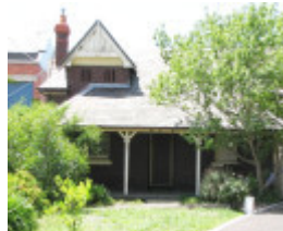
AUBURN UNITING CHURCH COMPLEX SOHE 2008