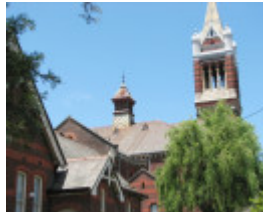
AUBURN UNITING CHURCH COMPLEX SOHE 2008