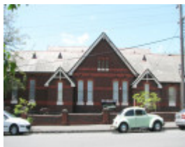
AUBURN UNITING CHURCH COMPLEX SOHE 2008