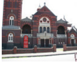
AUBURN UNITING CHURCH COMPLEX SOHE 2008