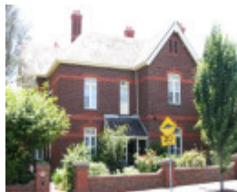
AUBURN UNITING CHURCH COMPLEX SOHE 2008