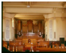
h02034 uniting church auburn interior and organ