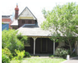
AUBURN UNITING CHURCH COMPLEX SOHE 2008