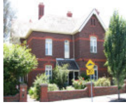
AUBURN UNITING CHURCH COMPLEX SOHE 2008