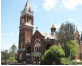
AUBURN UNITING CHURCH COMPLEX SOHE 2008