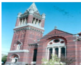
h02034 uniting church auburn h2034