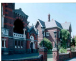
h02034 uniting church auburn manse