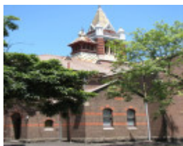
AUBURN UNITING CHURCH COMPLEX SOHE 2008