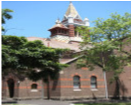
AUBURN UNITING CHURCH COMPLEX SOHE 2008