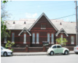
AUBURN UNITING CHURCH COMPLEX SOHE 2008