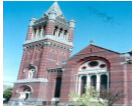
h02034 uniting church auburn h2034