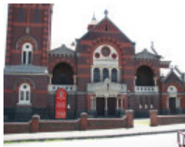
AUBURN UNITING CHURCH COMPLEX SOHE 2008