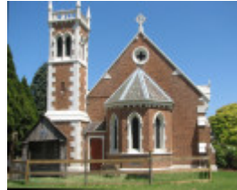
CHRIST CHURCH SOHE 2008