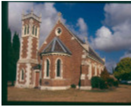
H00225 1 christ church dingley feb 2003