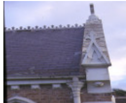
christ church old dandenong road dingley village roof view