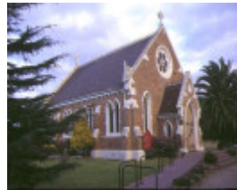
1 christ church old dandenong road dingley village front view