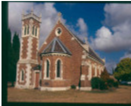
H00225 1 christ church dingley feb 2003