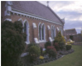
christ church old dandenong road dingley village side view