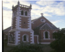
christ church old dandenong road dingley village front elevation