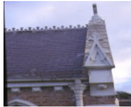
christ church old dandenong road dingley village roof view