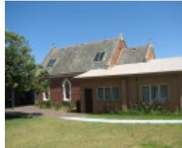
CHRIST CHURCH SOHE 2008