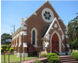
CHRIST CHURCH SOHE 2008